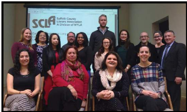
2018 SCLA Board