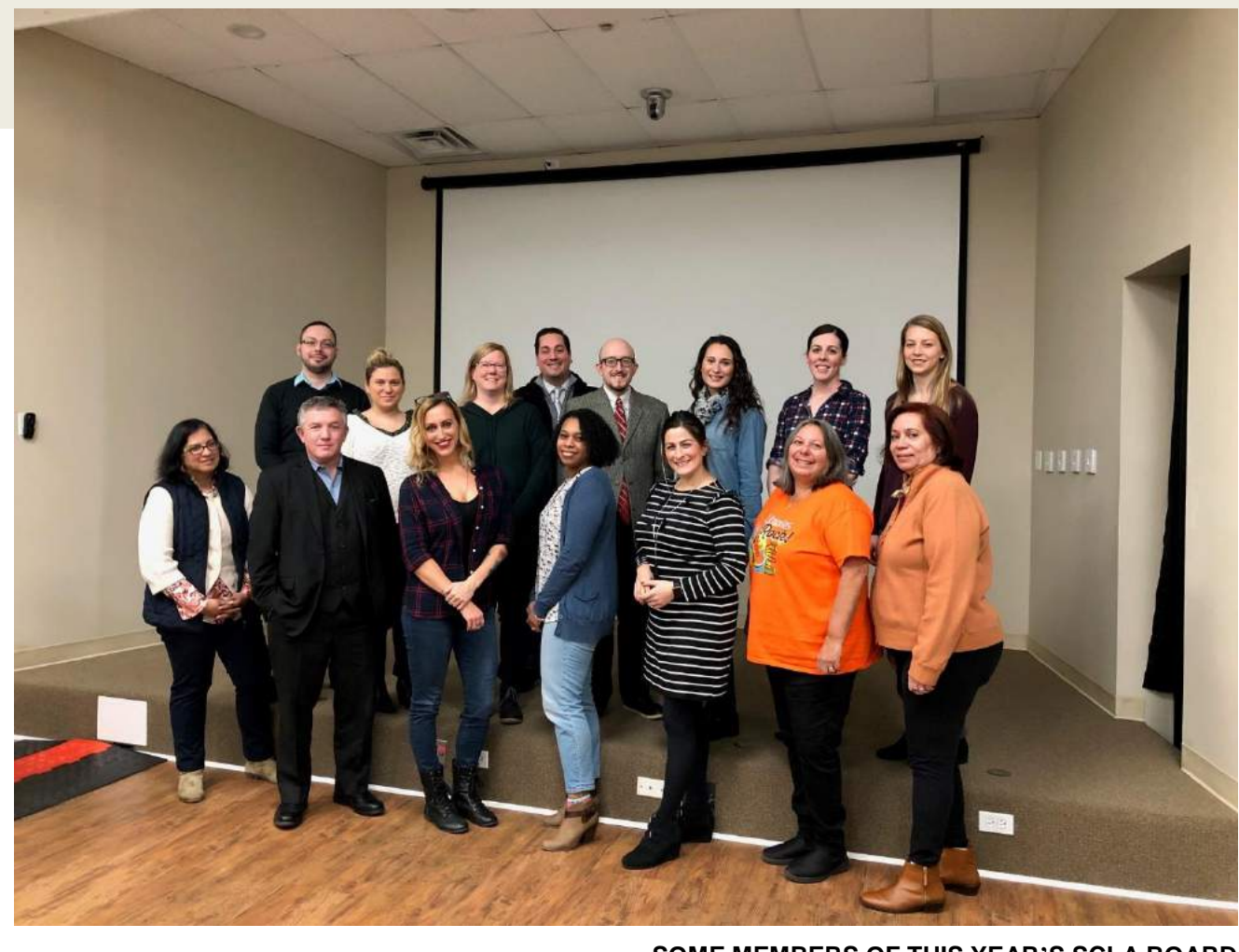
SOME MEMBERS OF THIS YEAR'S SCLA BOARD