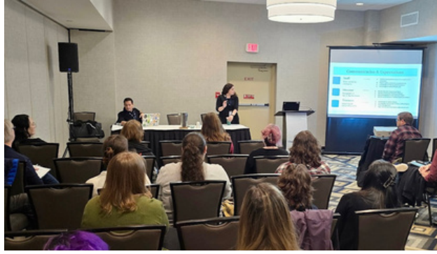
NYLA - Judged by the Covers: Organize, Advocate, and Overcome

Also in November, CATS hosted another makerspace tour, this time at Middle Country Public Library's Innovation Space. Attendance was outstanding, and participants were truly impressed by the depth and creativity of MCPL's services. These tours continue to be among our most popular offerings because they provide real world models and ideas that libraries can adapt to their unique communities.