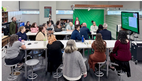
Connetquot Public Library's Learning Commons Tour

In October, we held a joint meeting for the East End Tech Coalition and the Technical Services Roundtable at Rogers Memorial Library in Southampton. The meeting brought together staff from multiple libraries to exchange ideas, compare workflows, and strengthen professional networks through open discussion and shared problem solving. Also that month, we hosted a makerspace tour at the Connetquot Public Library's Learning Commons. Attendees had the chance to see innovative equipment in action, talk with staff about their workflows and service models, and leave with practical inspiration to bring back to their own libraries.