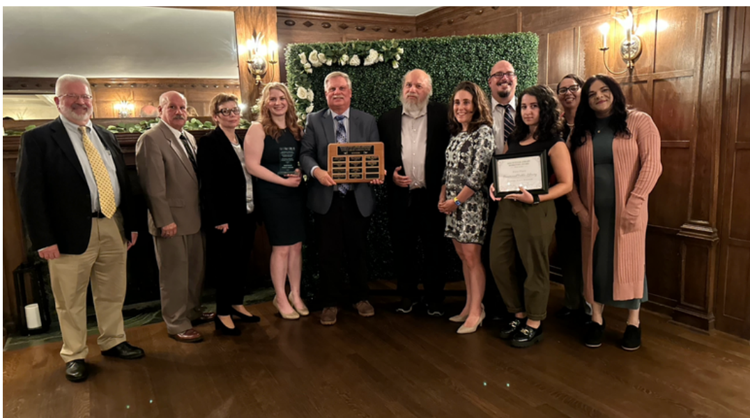
Caption: Representatives of the Brentwood Public Library at the SLMA award presentation on Oct. 26, 2023.