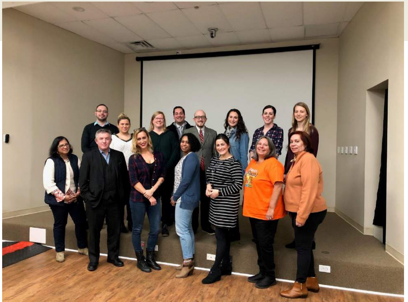
SOME MEMBERS OF THIS YEAR'S SCLA BOARD