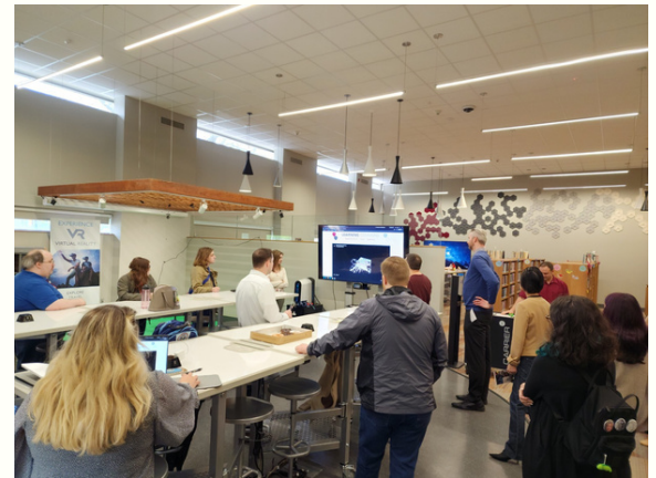
Connetquot Makerspace Tour